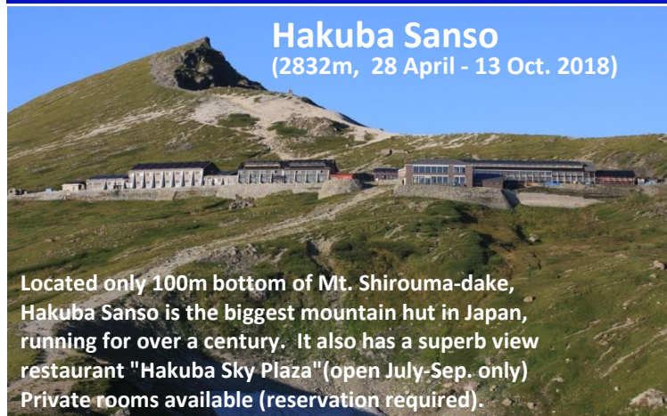
Hakuba Sanso (2832m, 28 April - 13 Oct. 2018)

with 7 huts through Hakuba Mountains, Northern Japan Alps, Hakubakan provides wonderful mountain experience!